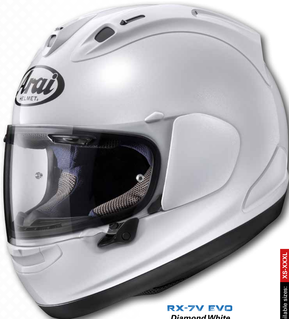
RX-7V EVO Diamond White

** Innovated and exclusively offered by Arai